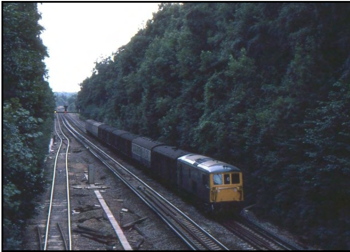
Left: A 73 passes near Cophold Junction.

Other than giving the right away for an average of three trains an hour, and occasionally sweeping out a carriage or the platform, time was spent trying to keep warm while standing around doing virtually nothing. I certainly learnt a lot